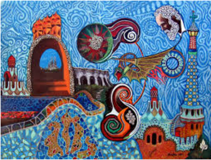
Gaudi mosaic painting