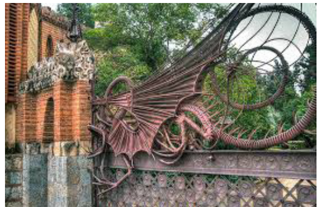
The Park Güell (1900-1914)