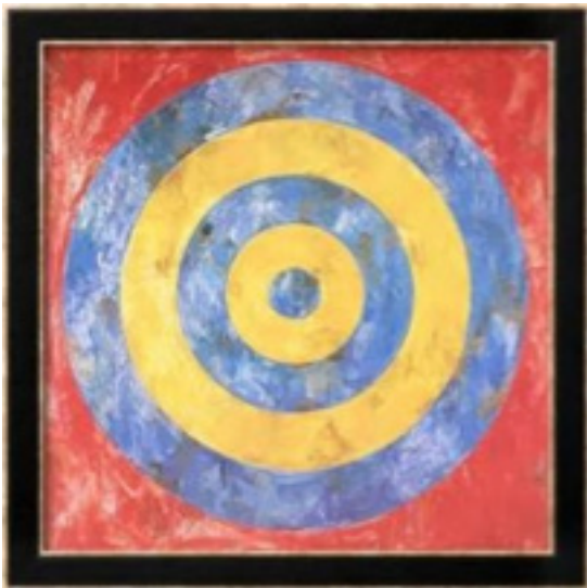
Pop Art Target