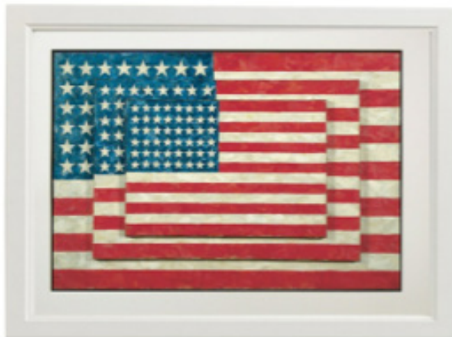
Jasper Johns' Flags