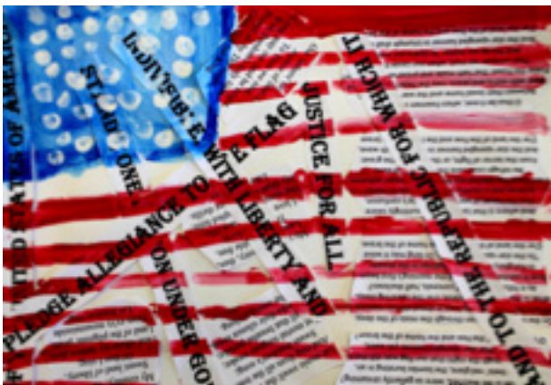
Student created flag collage