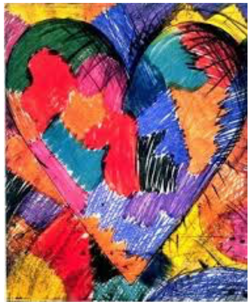
Jim Dine monotypes et gravures